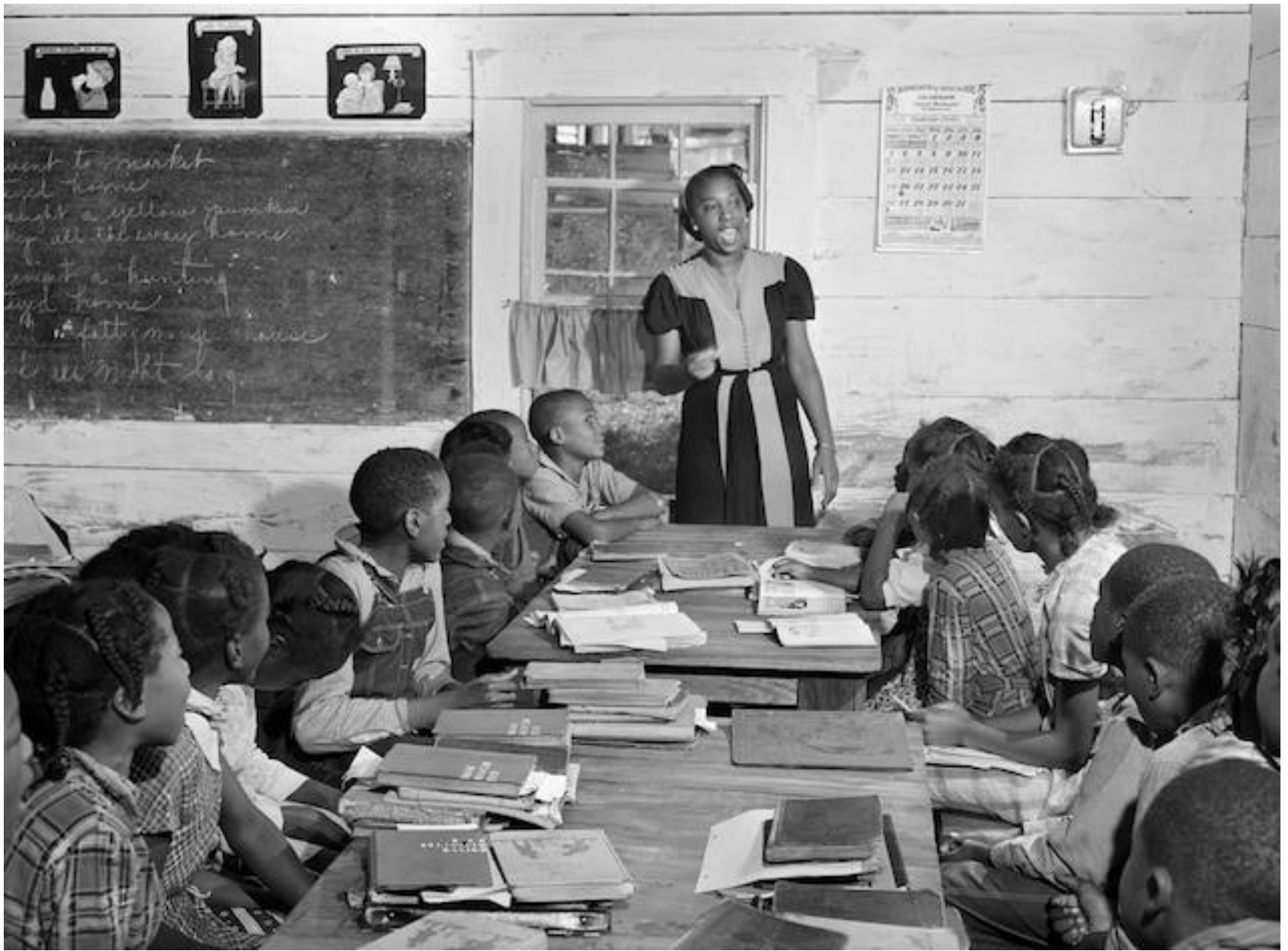
Georgia, USA, 1941