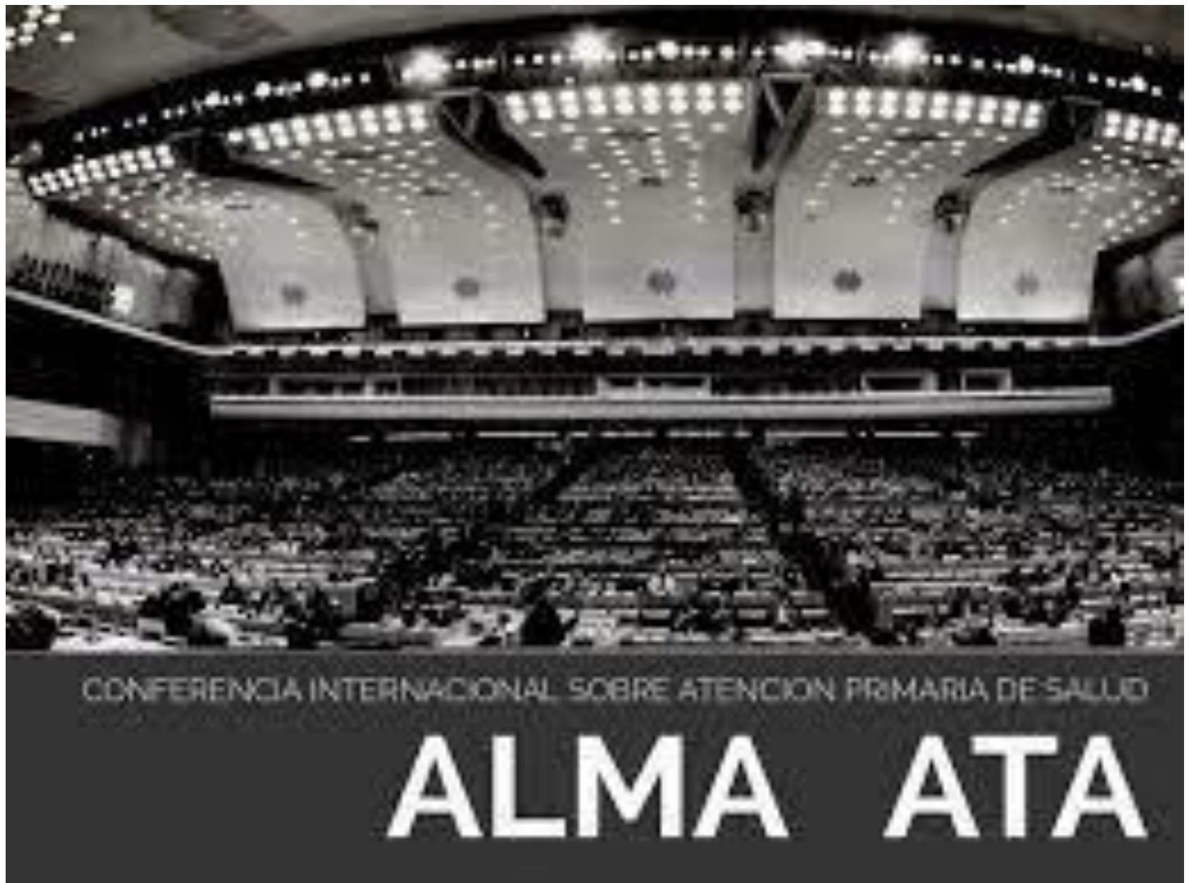
Alma Ata declaration, Sept 78, Russia