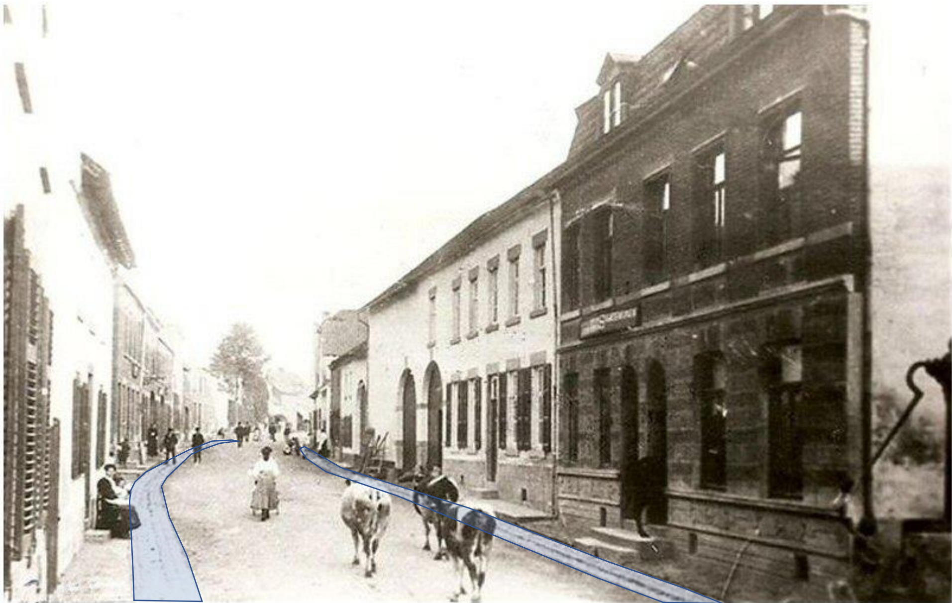
Meerssen (south of The Netherlands, ca. 1890)