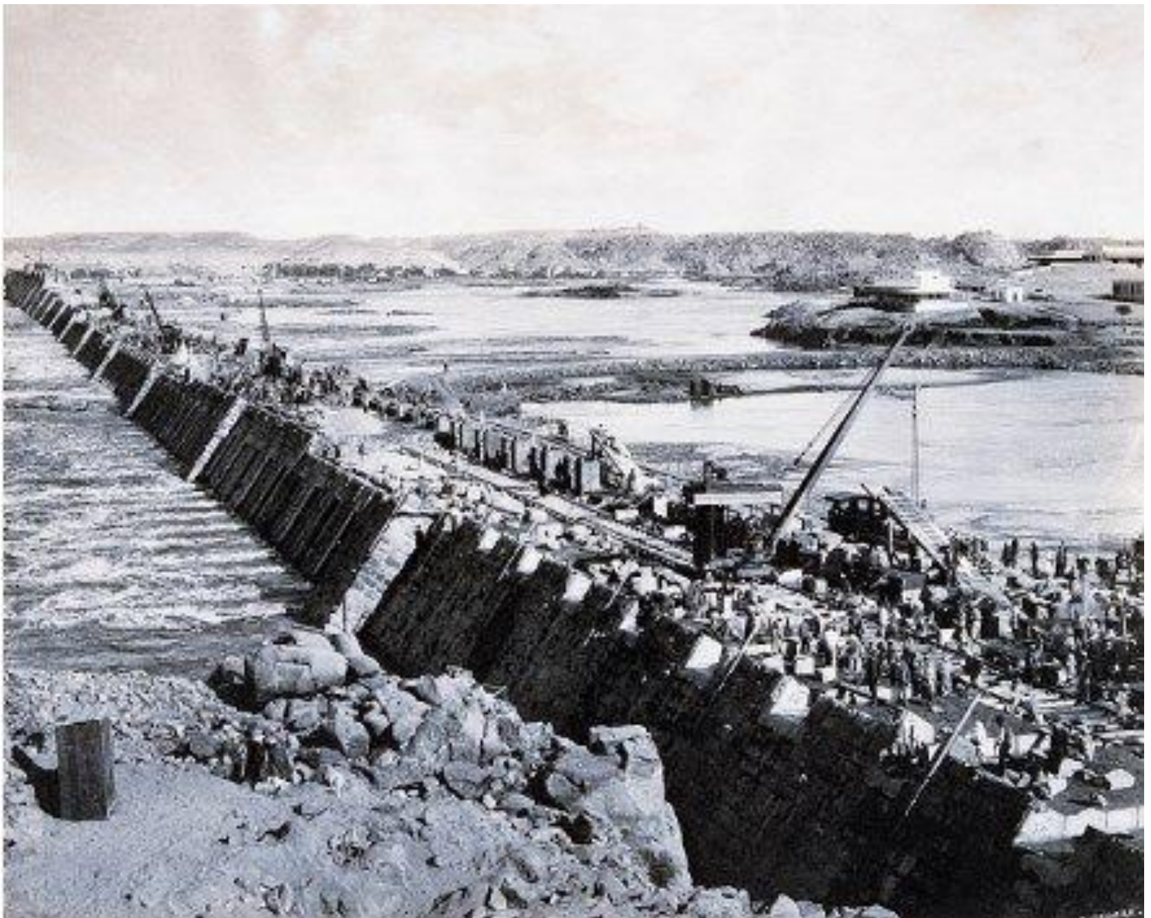
Aswan dam, Egypt. Construction, 1960s