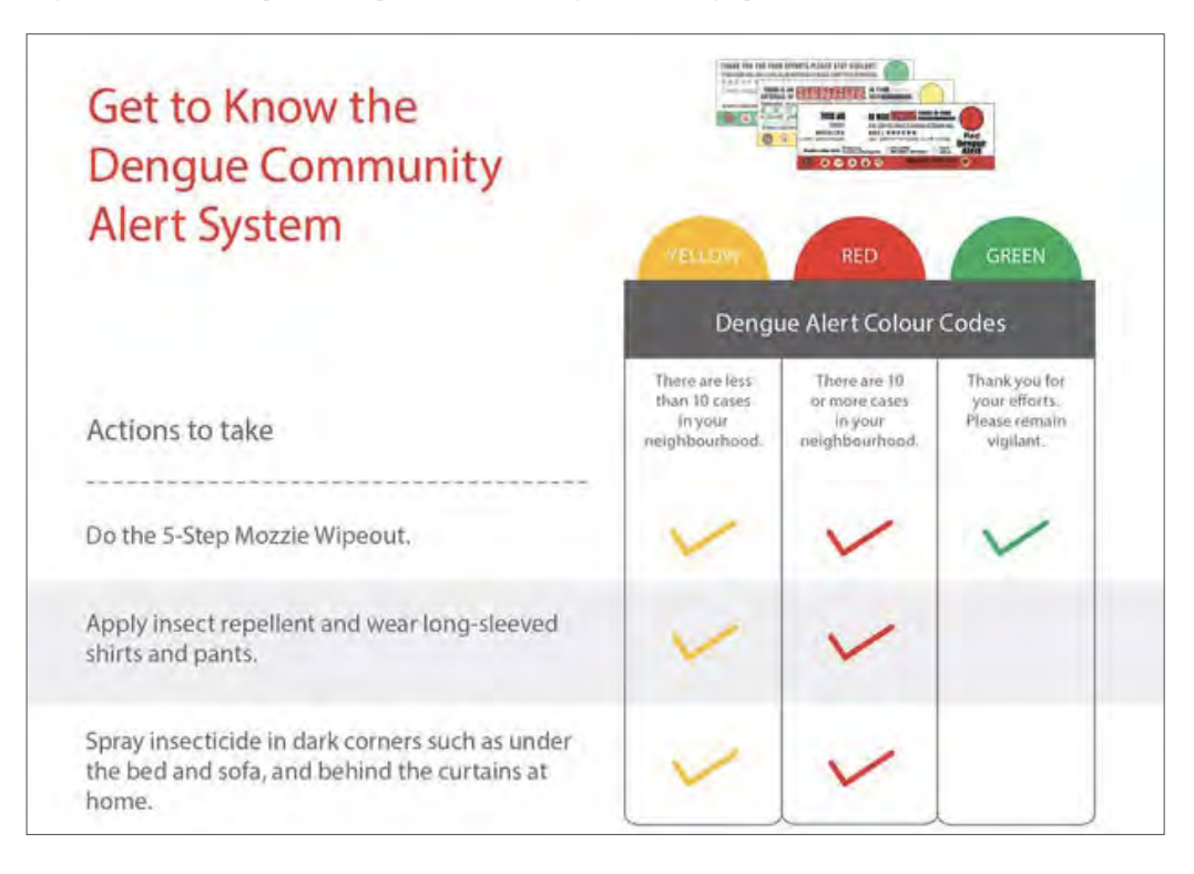
Fig. 2. Community alert system for dengue in Singapore

Meeting experts noted that multiple strategies could potentially be justified in different contexts, differentiating between response to epidemic outbreaks and routine control, and identified coercion in vector control as an issue warranting comprehensive ethical analysis.