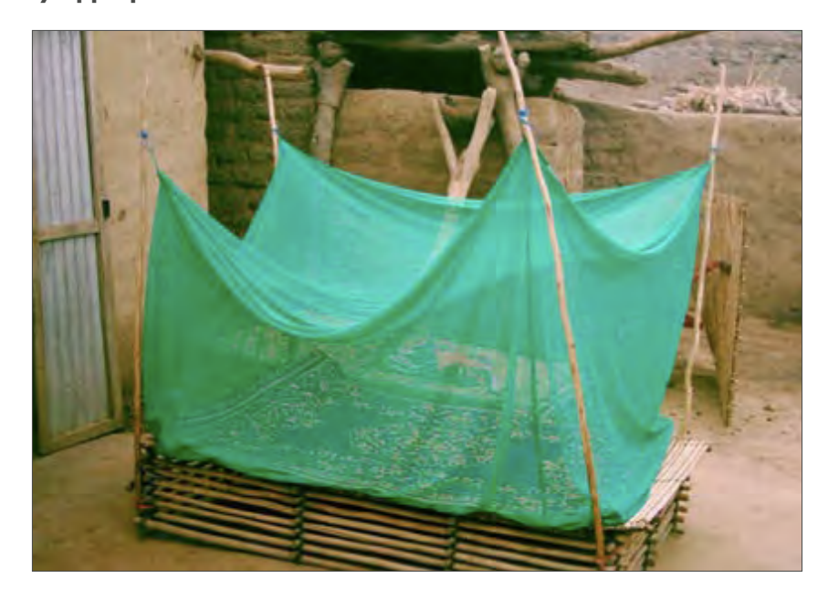
Fig. 1. Culturally appropriate bed net in Burkina Faso

Challenges to the control of other VBDs include shortages of diagnostic tests for dengue, resulting in nonspecific treatment for febrile illnesses in areas co-endemic for malaria and dengue. Local health authorities encounter many ethically relevant policy questions associated with priority setting (e.g. prevention versus treatment) in the context of limited resources, most of which are obtained externally.